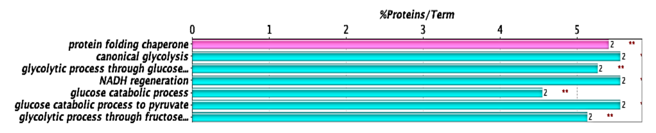
Figure 3. Bar chart view of biological process terms associated with hub-bottlenecks of the protein-protein interaction network, p \le 0.05

A scale free network was approved by exhibiting a scatter plot of degree and betweenness centrality distributions. Based on this analysis, few numbers of nodes demonstrated high values of degree and betweenness centrality which is a nature of scale-free network.